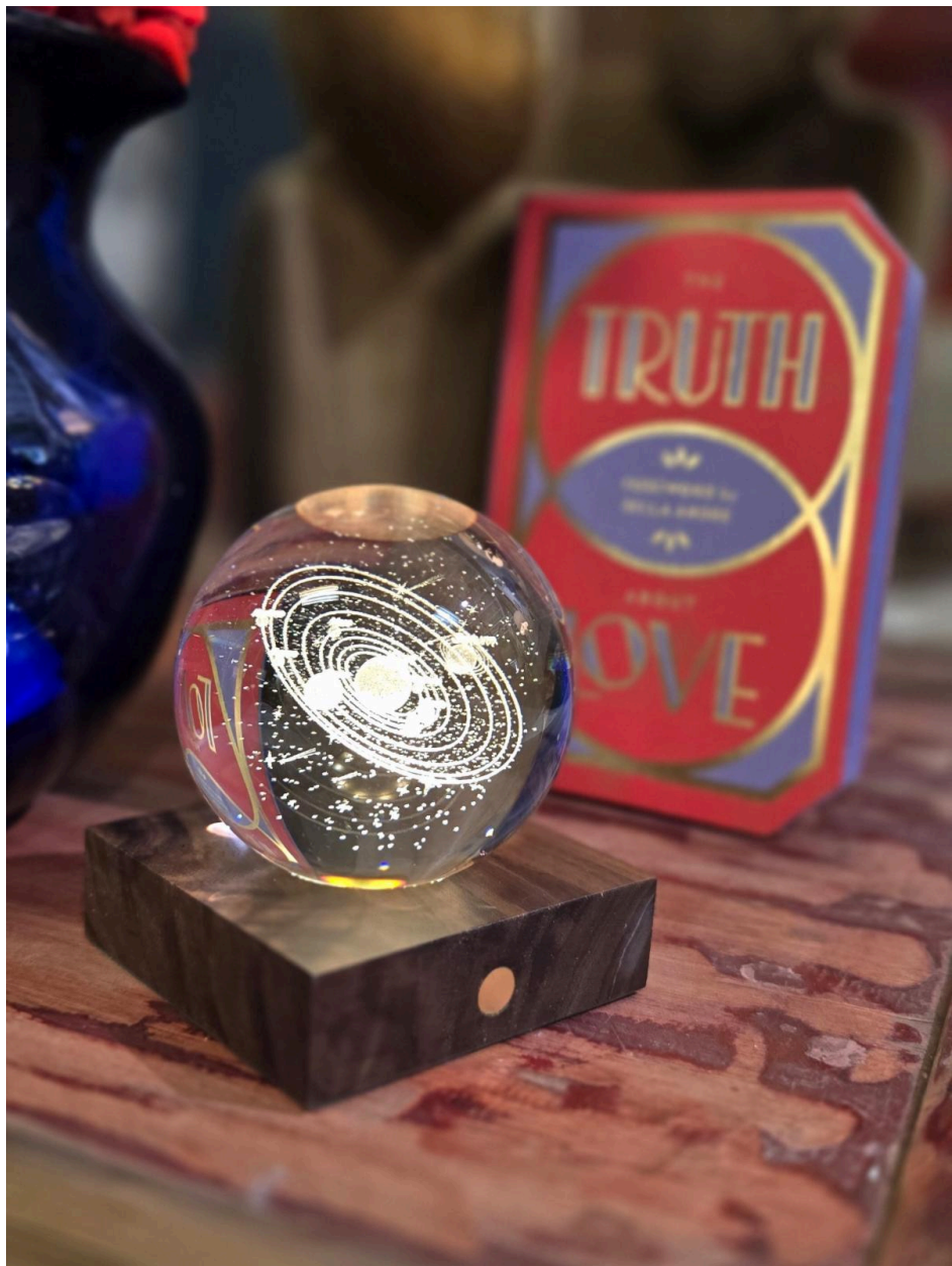
The Solar System