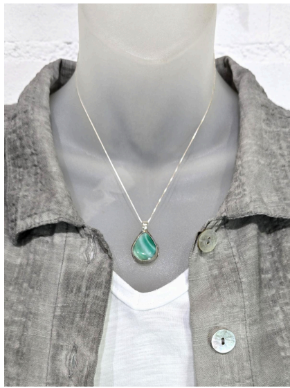
Iguana Shirt $162 XCVI Tee $70 Iguana Pants $148 Bill Potter Necklace $120