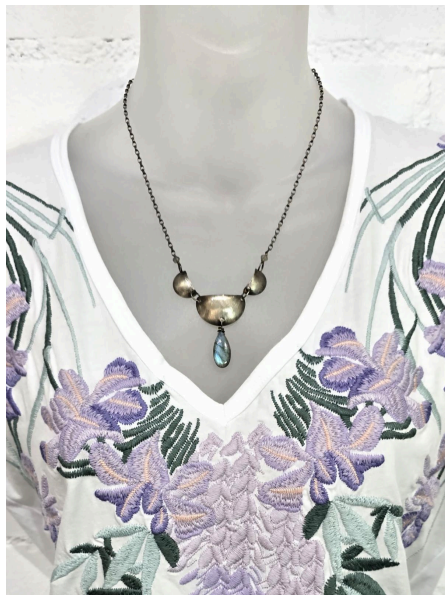
Johnny Was Deep Vee Tee $148 Cynthia Ashby Pants $216 Jayme Driver Necklace $124