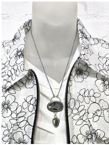
Radzoli Jacket $104 Lotus Eaters Top $166 Iguana Pants $148 Feral Blue Necklace $225