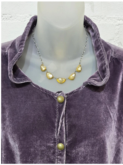
Artists & Revolutionaries Top $218 Ozai N Ku Pants $192 Austin Titus Studio Necklace $875