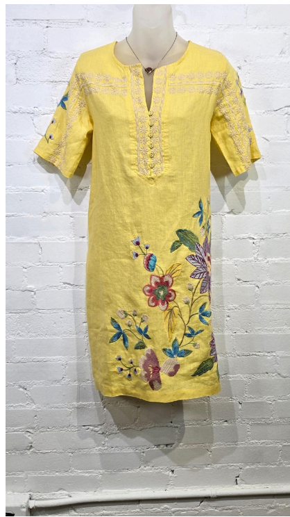
Johnny Was Linen Dress $238 Austin Titus Studio Necklace $550