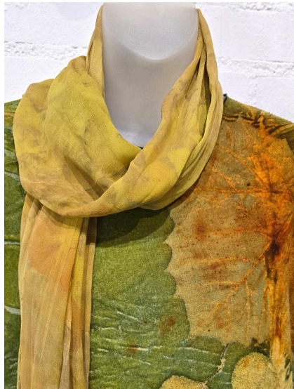
Artists & Revolutionaries Skirt $208 KBennerDesigns Top $220 KBennerDesigns Scarf $180