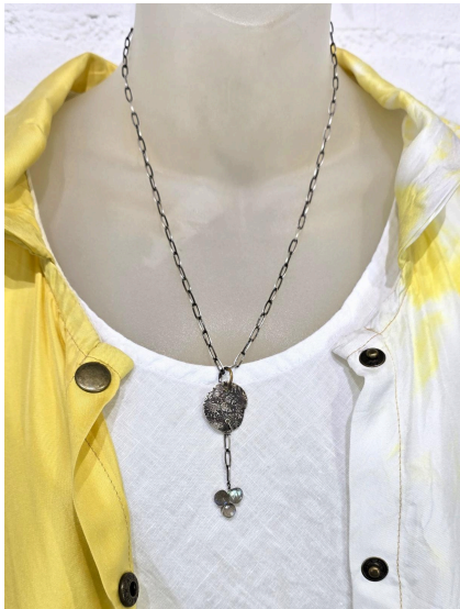
Artists & Revolutionaries Top $228 Blueberry Tank $104 DAZE Denim Jeans $108 Jayme Driver Necklace $114