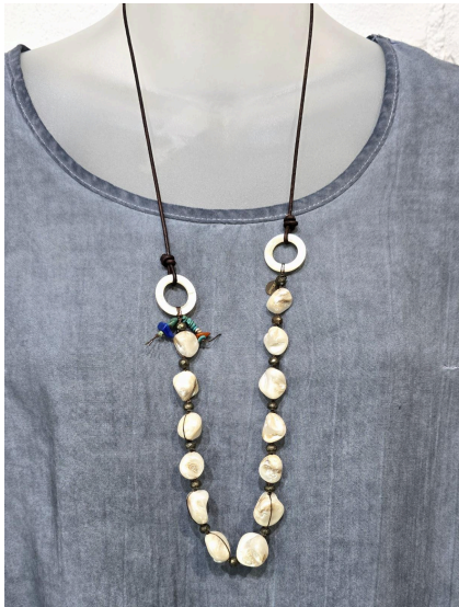
Radzoli Top $98 Radzoli Pants $98 Y-Knot? Necklace $140