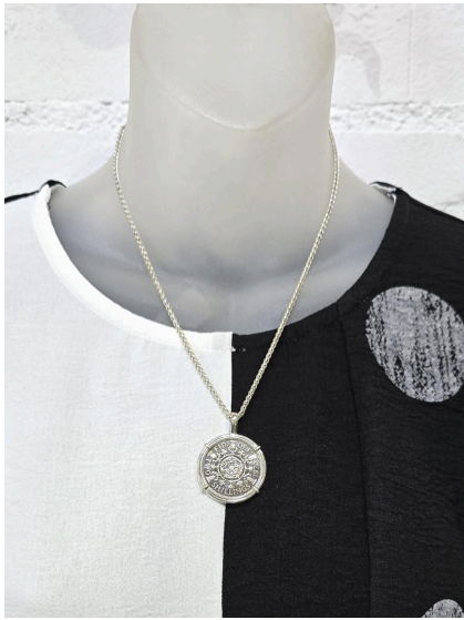
Radzoli Top $104 Ozai N Ku Skirt $208 Karen Wright Necklace $310