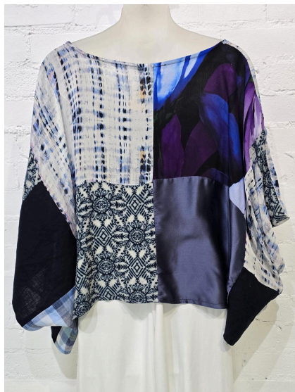
Artists & Revolutionaries Top $

All of our clothing is pre-laundered, and most is machine-washable unless otherwise specified; care is a breeze!