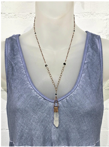
Radzoli Dress $136 ObscurO Necklace $88