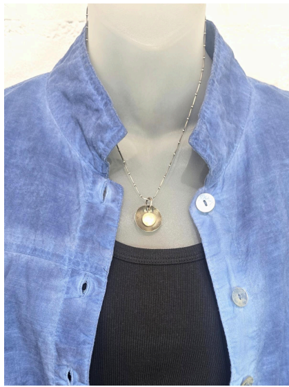
Iguana Shirt/Jacket $168 It Is Well LA Tank $70 Amici Pants $262 Bussola Sandals $140 Jayme Driver Necklace $80