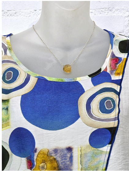
Radzoli Top $104 Chalet Pants $126 ObscurO Jewelry Necklace $146