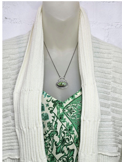
Johnny Was Dress $318 Red Thread Sweater $328 Feral Blue Necklace $225