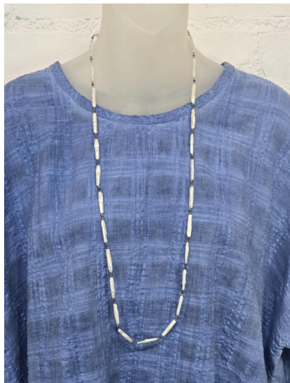
Iguana Top $148 Iguana Pants $152 Luna Mar Creative Necklace $160