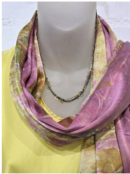
Artists & Revolutionaries Siren Dress $ KBennerDesigns Scarf $240 Austin Titus Studio Necklace $665