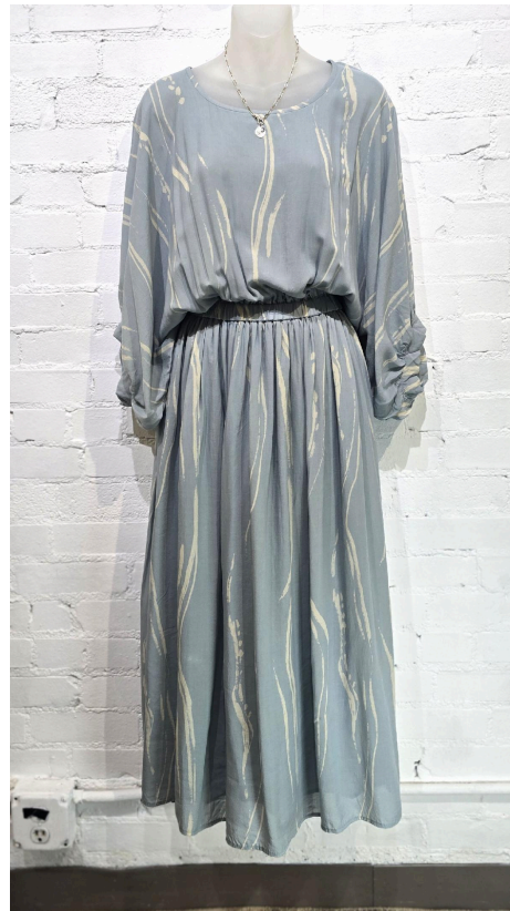
Bel Kazan Dress $284 Luna Mar Creative Necklace $130