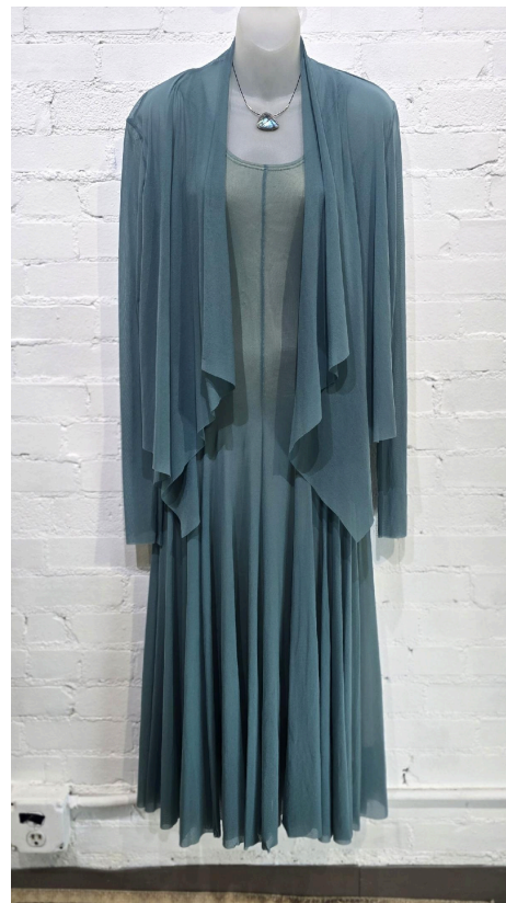
Petit Pois Mesh Dress $284 Petit Pois Open Cardigan $132 Jayme Driver Necklace $180