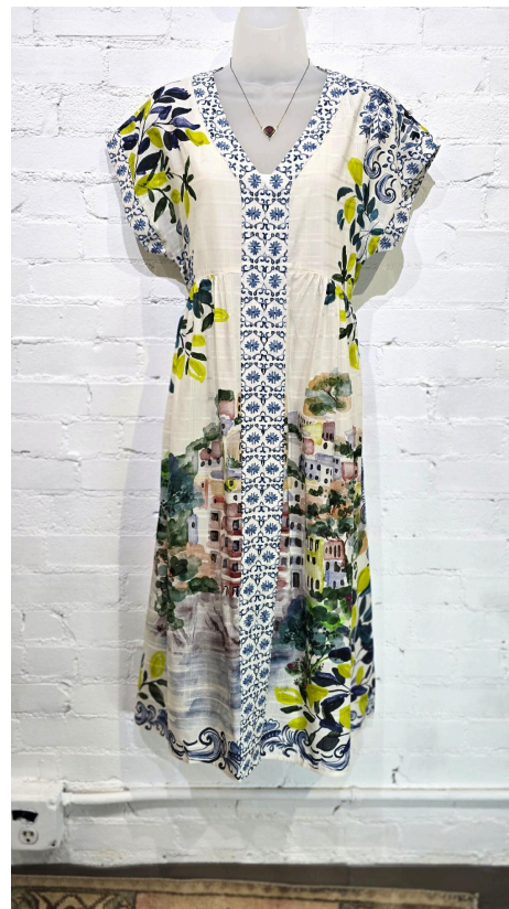
Johnny Was Dolman Dress w/slip $274 Austin Titus STUDIO Necklace $550

Crafted from a breathable cotton blend, the V-Neck Dolman Effortless Dress is embellished with a vibrant scenic print inspired by coastal villages and olive branch motifs. Featuring a V-neckline with a contrasting border, this dress offers an empire waist and a flowing A-line skirt. Complement with sparkling gold jewelry accents and wedge heels for a polished daytime event.