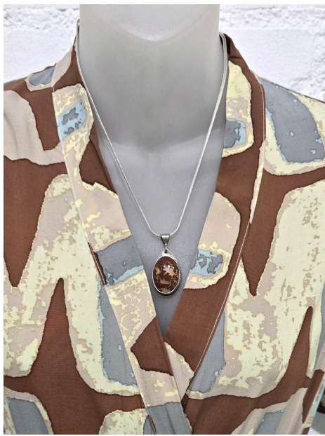
Bel Kazan Dress $252 Bill Potter Necklace $140