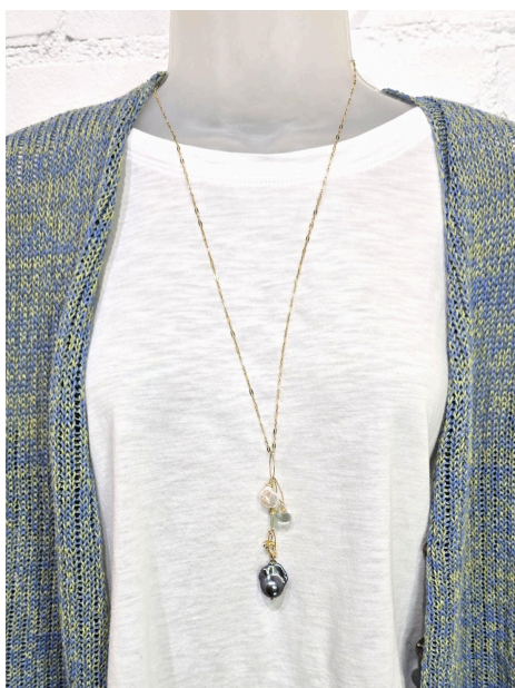
It Is Well LA Baby Tee $70 Red Thread Sweater $324 It Is Well LA Gauze Pants $170 Luna Mar Creative Necklace $180