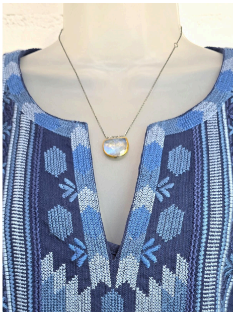
Johnny Was Solange Kaftan Dress w/slip $274 Austin Titus STUDIO Necklace $398