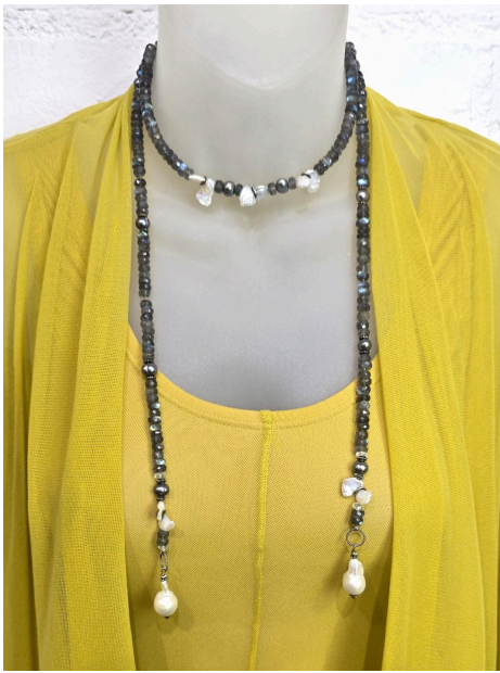
Petit Pois Mesh Dress $284 Petit Pois Open Cardigan $132 Luna Mar Creative Necklace $190