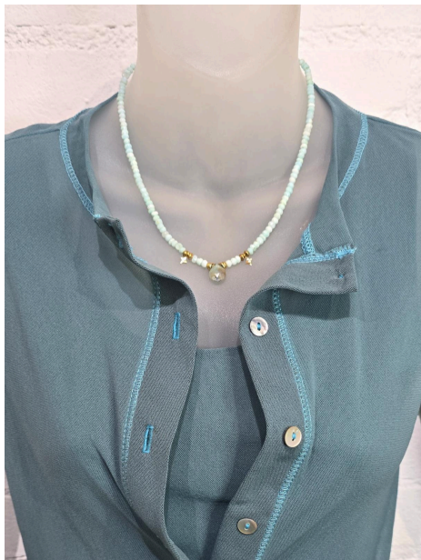
Petit Pois Tank $99 Petit Pois Cardigan $138 Petit Pois Palazzo Pant $108 Luna Mar Creative Necklace $125