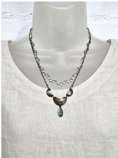
It Is Well LA Linen Top $158 It Is Well LA Gauze Pants $170 Jayme Driver Necklace $124 Austin Titus Studio Necklace $545