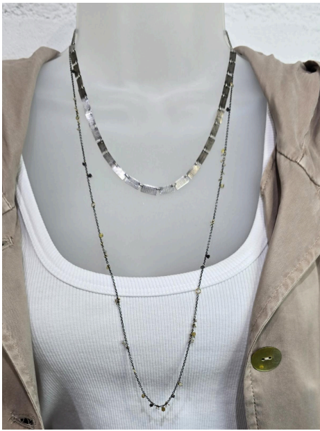
Marrakech Jacket $208 It Is Well LA Tank $70 Marrakech Pants $192 Austin Titus Studio Necklaces $525 & $775