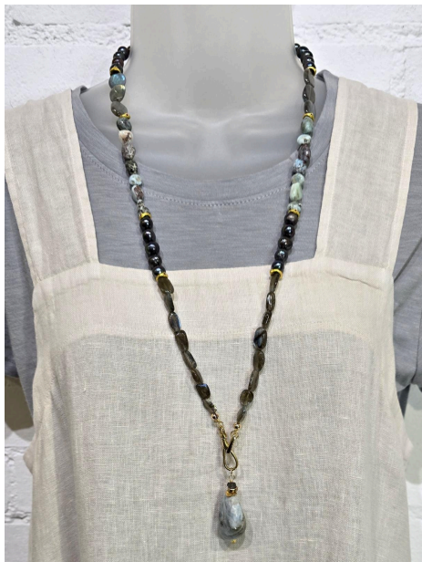
It Is Well LA Linen Dress $210 It Is Well LA Baby Tee $70 Luna Mar Creative Necklace $150