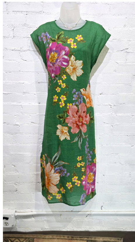
Johnny Was Side Slit Shift Dress $258 Austin Titus STUDIO Necklace $435

Adorned with vibrant florals in bold color, the Side Slit Shift Dress is crafted from a lightweight flowing fabric. Designed with a rounded neckline and short sleeves, this easy shift dress is perfect for a casual day with friends. Pair with slide sandals and a wide-brim sun hat for a polished casual look.