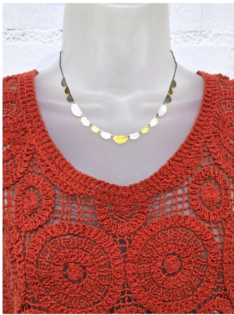
Apricot Tank $70 Marrakech Pants $180 Austin Titus Studio Necklace $386