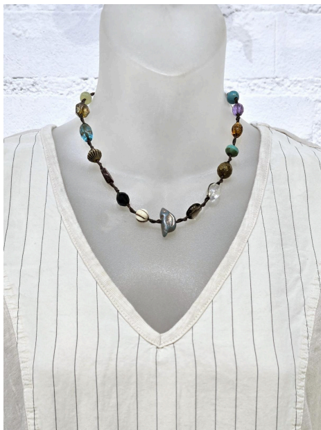
XCVI Tank $98 XCVI Pant $130 Y-Knot? Necklace $104