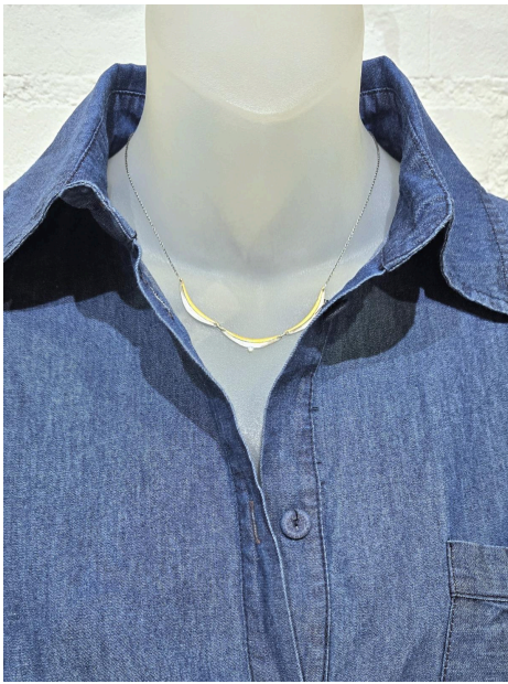
Baci HiLow Cropped Shirt $216 M.I.L.A. Gauze Pants $170 Austin Titus Studio Necklace $435