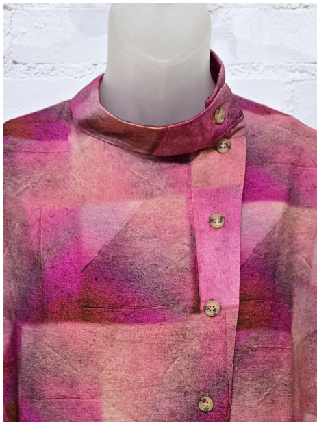
Ozai N Ku Top $192 Ozai N Ku Skirt $208