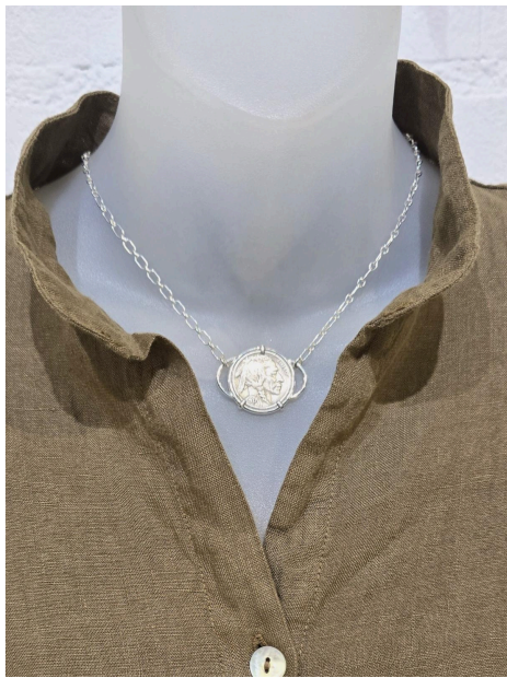
Blueberry Dress $176 Karen Wright Designs Necklace $275