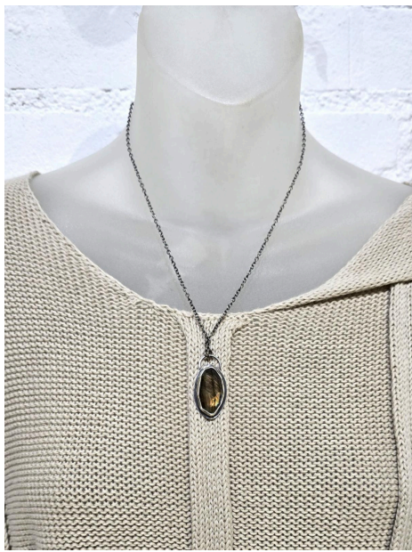
Blueberry Top $156 XCVI Skirt $124 Feral Blue Necklace $195