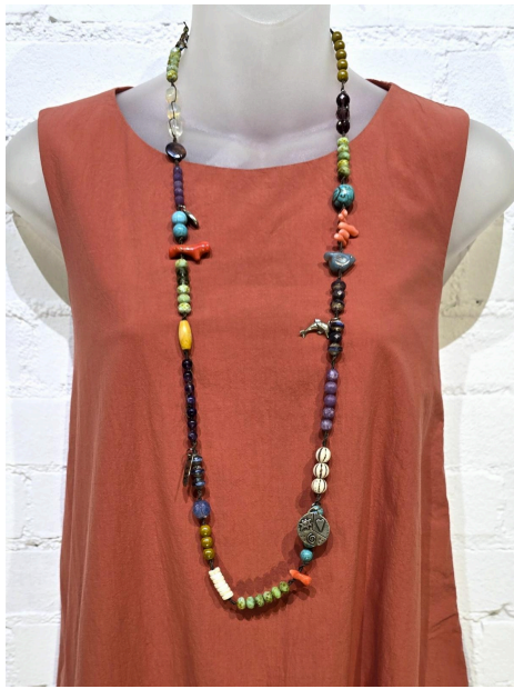
Ozai N Ku Dress $208 Y-Knot? Necklace $240