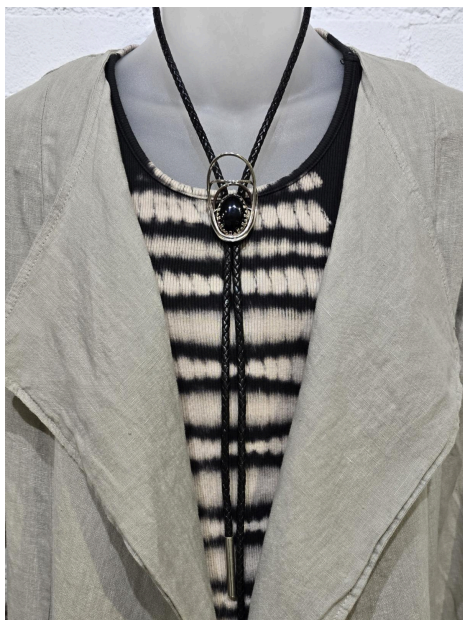
Blueberry Linen Coat $172 River + Sky Tank $104 XCVI Skirt $73 WASH DSGN Lariat Necklace $280