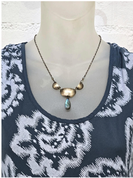
Blueberry Dress $148 Jayme Driver Necklace $124