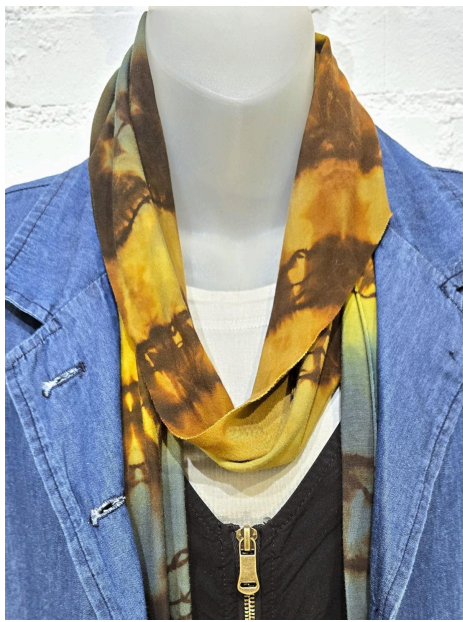
Baci Long Jacket $320 XCVI Tee $98 XCVI Jumpsuit $114 KBennerDesigns Scarf $95