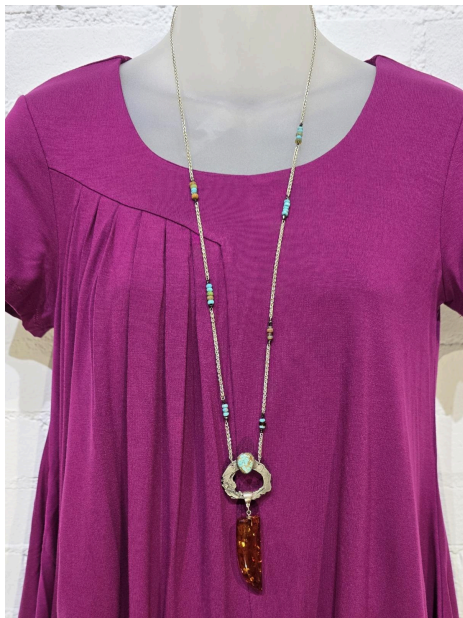
Ozai N Ku Shirt $156 Ozai N Ku Pants $252 ObscurO Necklace $1266