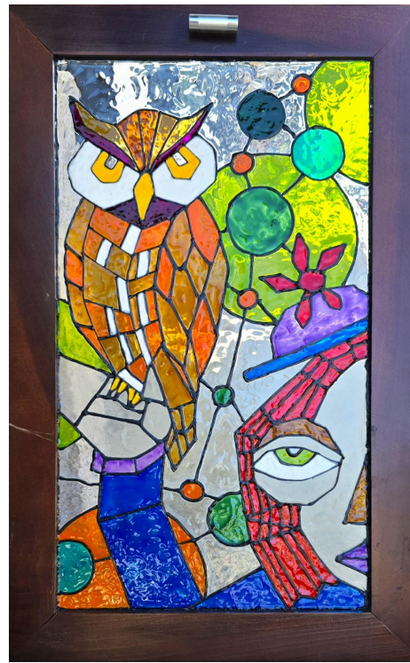
Handmade one of a kind local art made from Antique window frames. Exclusively at GlassBoat!