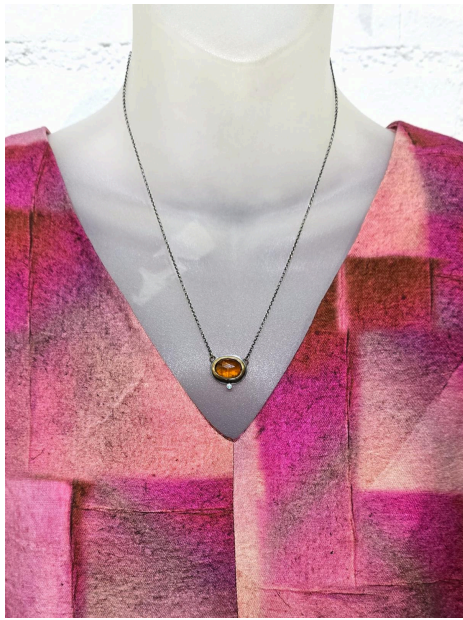
Ozai N Ku Dress $236 Austin Titus Studio Necklace $284