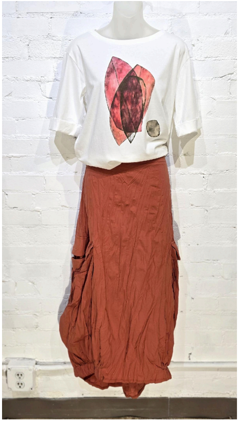
Ozai N Ku Shirt $128 Ozai N Ku Skirt $178