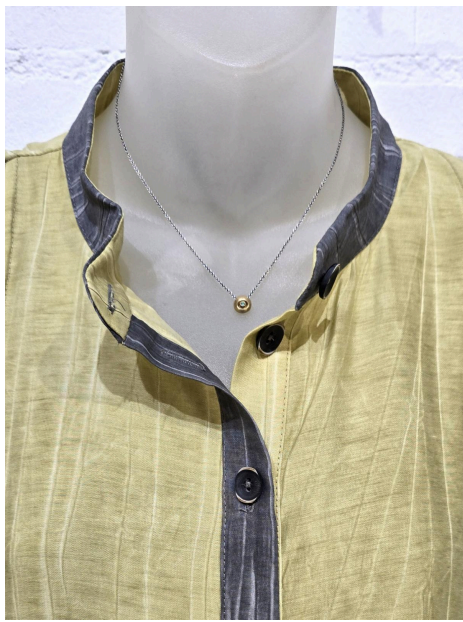
Ozai N Ku Top $178 Ozai N Ku Pants $192 Austin Titus Studio Necklace $395