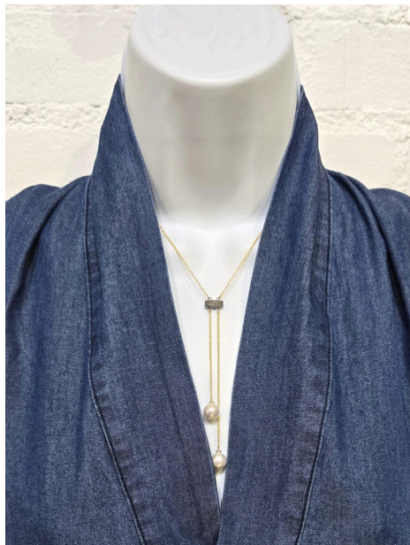
Baci Dress $288 Luna Mar Creative Necklace $230